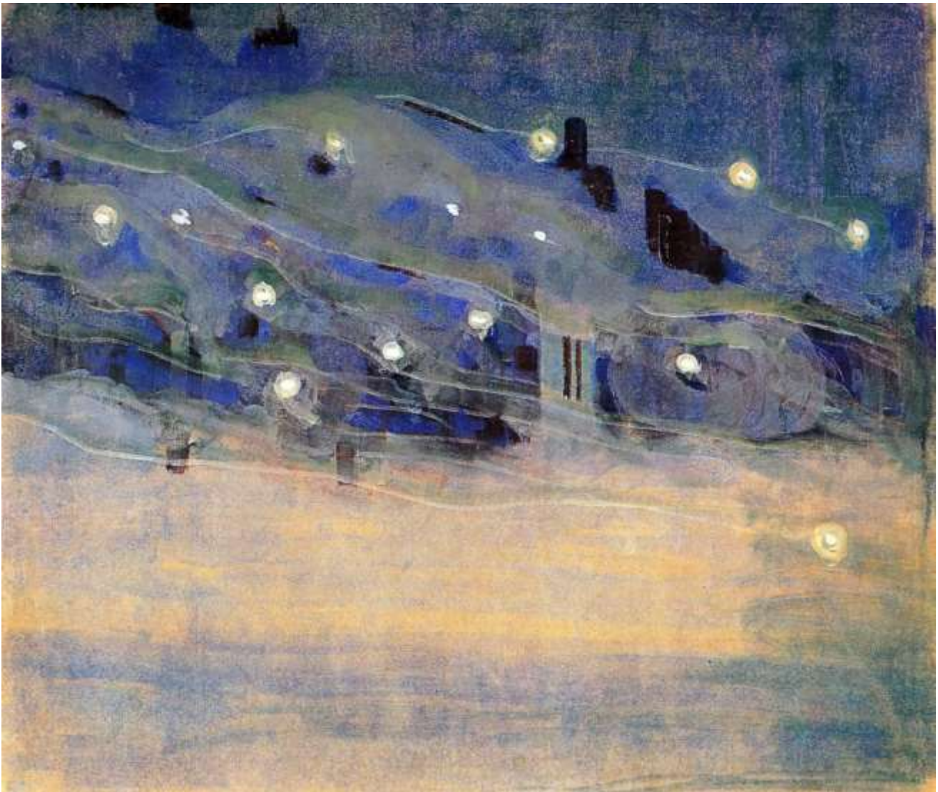
"Sparks III" by Mikalojus Konstantinas Ciurlionis