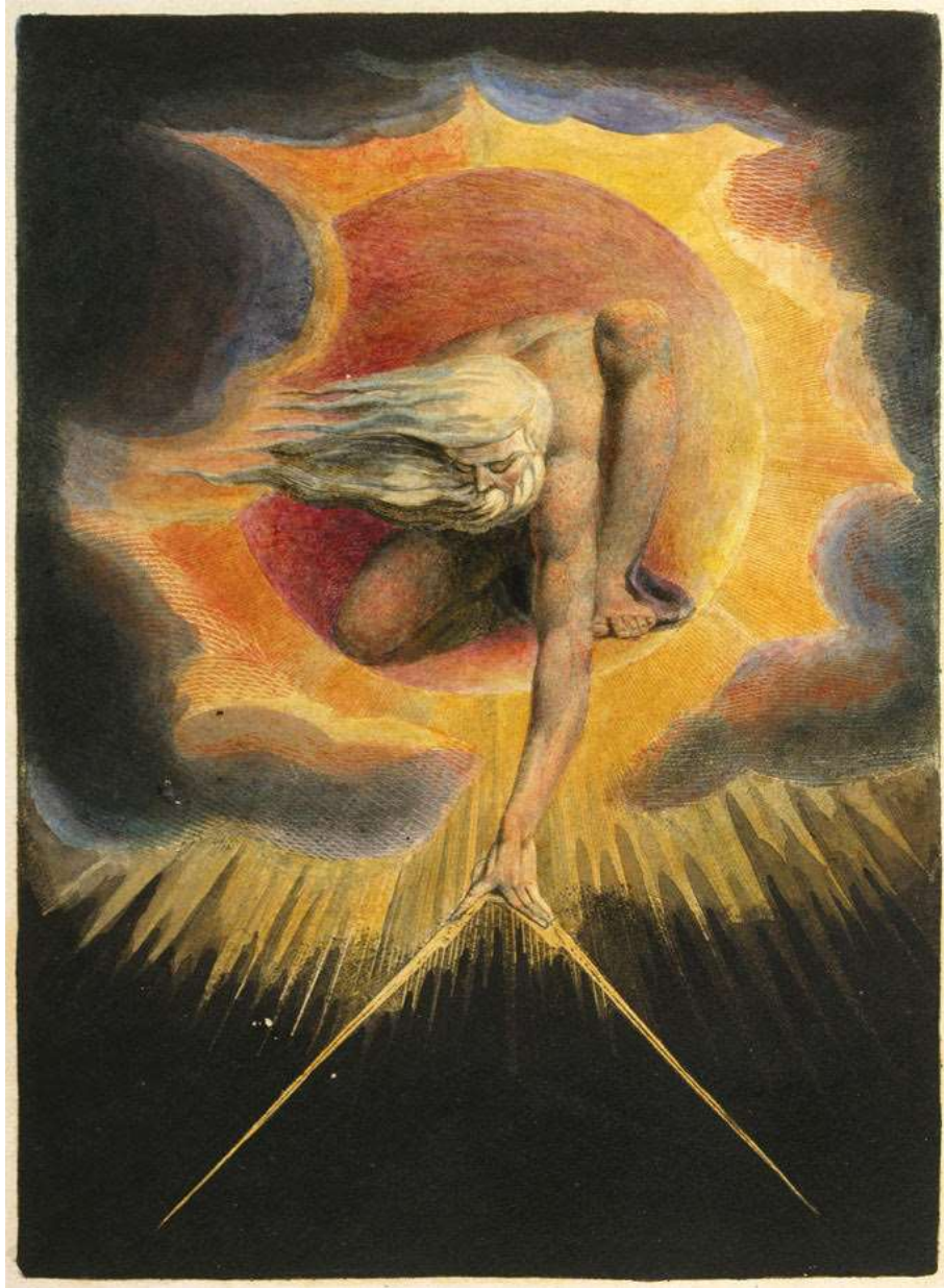
"Ancient of Days" by William Blake